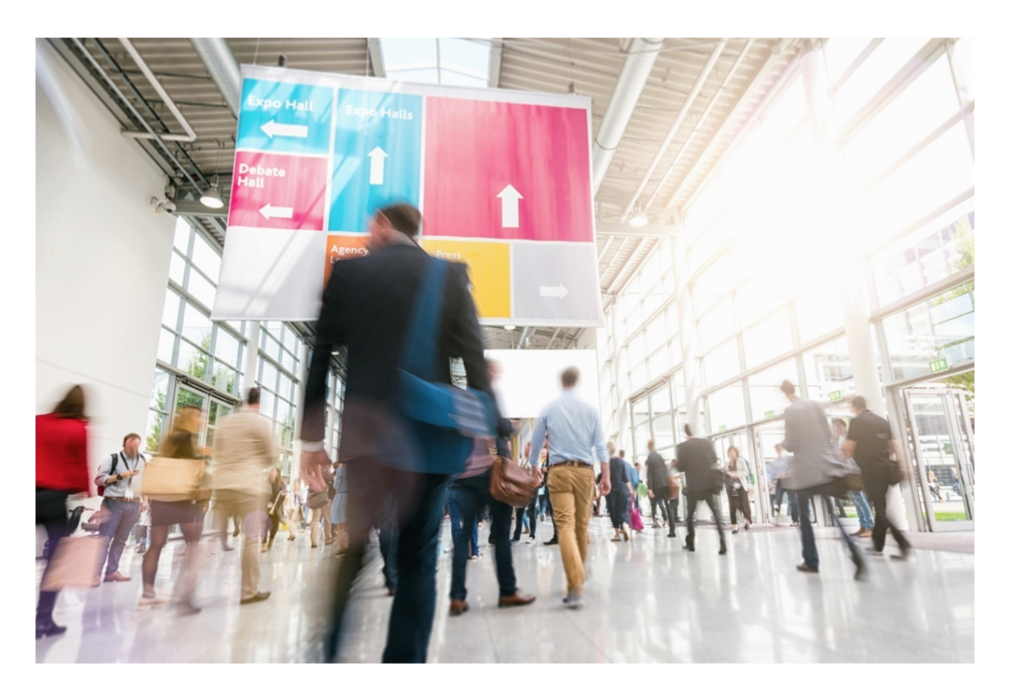
SUPPORT CATEGORIES & BENEFITS